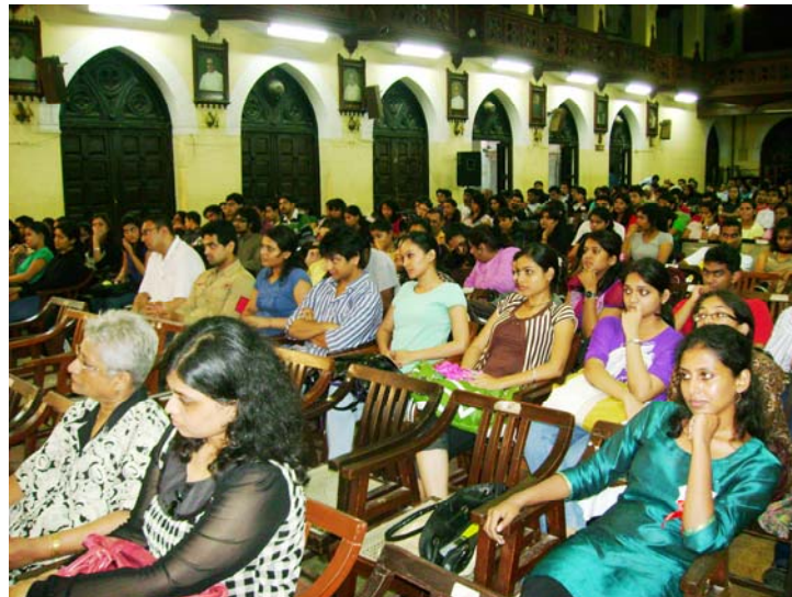
Bad weather – heavy rains and floods, did not prevent XIC students, from arriving on the third and final session of the orientation program – Alumni Forum – Meet the Professionals.